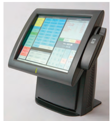
pointOne's touch screen terminal

solution has delivered on all its promises. It is easy to use, yet its functionality is very sophisticated. It has also been extremely reliable. The support that pointOne has given has always been proactive, and any problem or concern that I may have has always been resolved quickly. It is the perfect solution for any business looking to increase its bar efficiency and overall profitability."